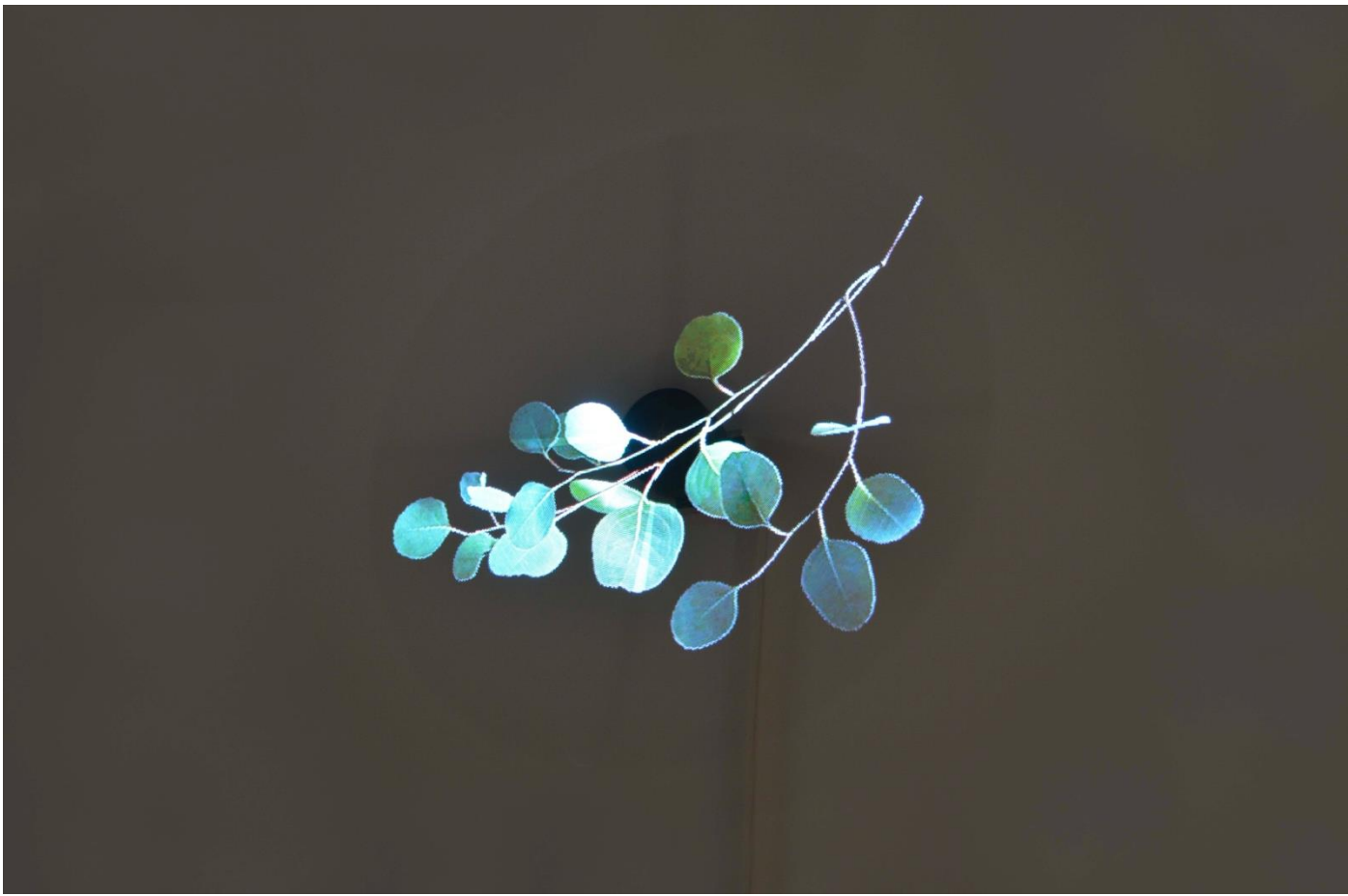
Close up image: blessedwithcaribbeansunlight.com , 2022

Eucalyptus displayed on LED holographic fan. Fan speed: 700 rotations per minute.