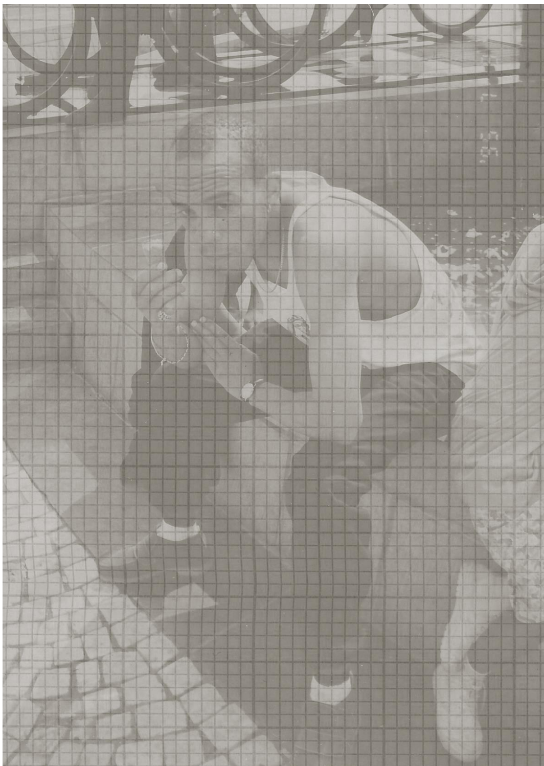
Connection Things , 2021, dimensions variable