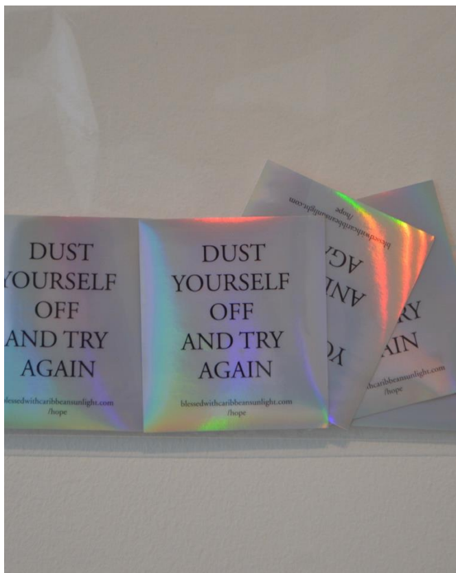
blessedwithcaribbeansunlight.com/hope , 2023, dimensions variable

Holographic [compostable] stickers, bioplastic bag.