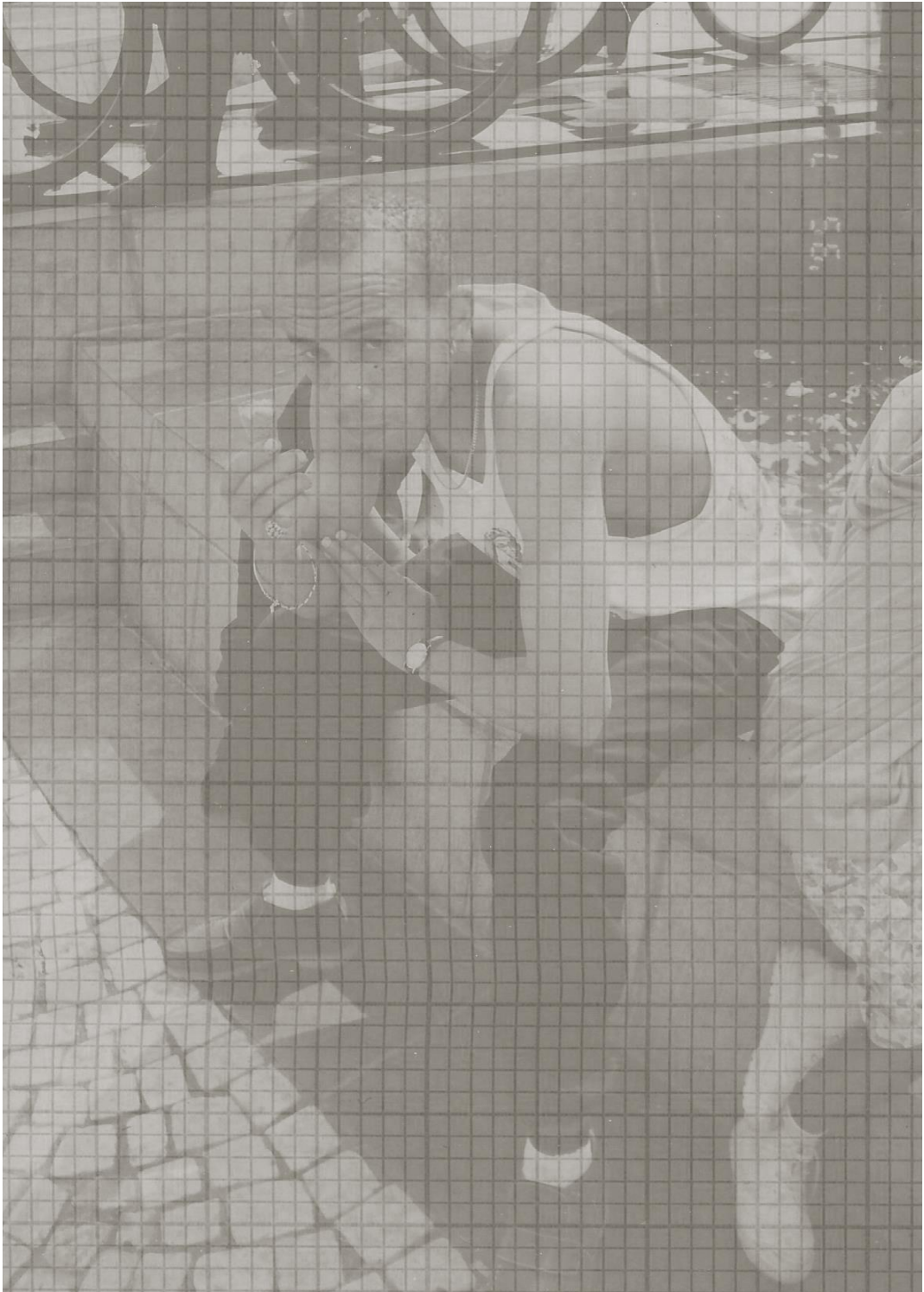
Connection Things , 2021, dimensions variable