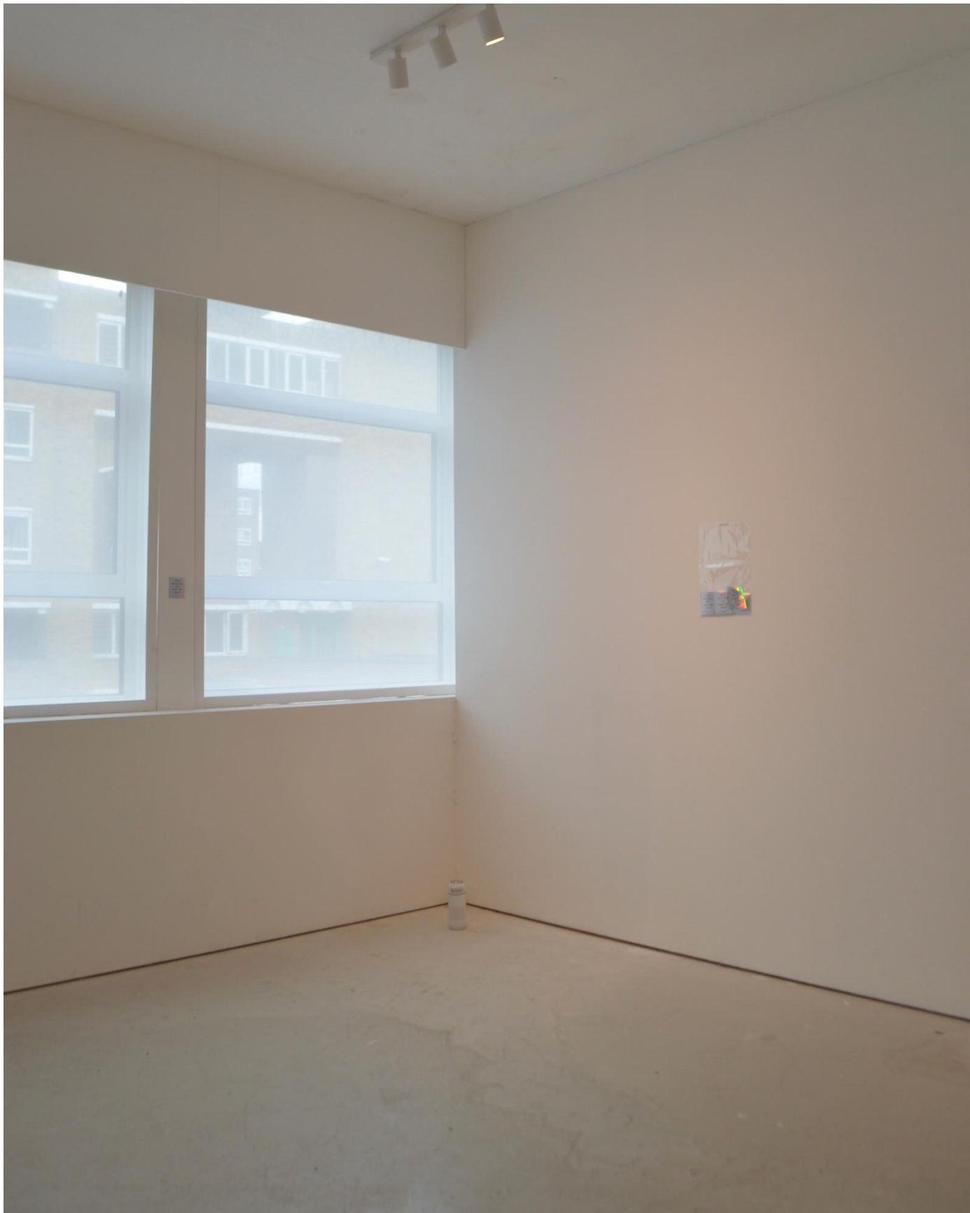
Installation view: blessedwithcaribbeansunlight.com/hope and 2. Vibe </S130885-1DU>, as part of 'Loops Made 2 Hold Us // Take Care 2gether.wav' at Metroland Cultures, 2023.