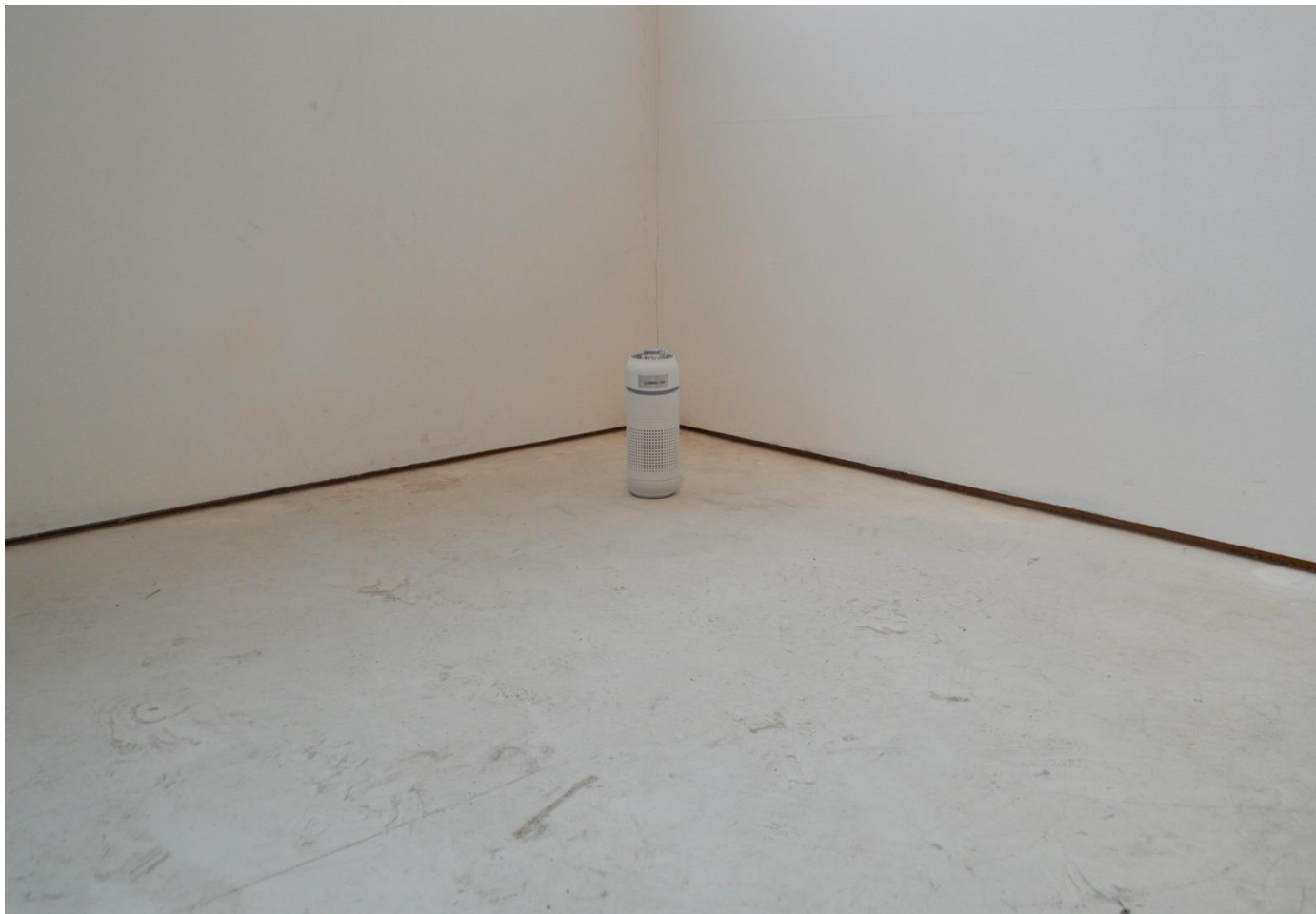
2. Vibe </S130885-1DU>, 2023, 15x8x8cm

Clear calcite crystal on air purifier embedded with opalite and a filter soaked in moon water. Charged with solar power captured in the Caribbean.