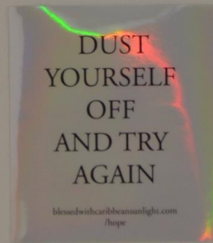
Close-up image: blessedwithcaribbeansunlight.com/hope , 2023, 10x6x0.2cm

Holographic [compostable] stickers, bioplastic bag.