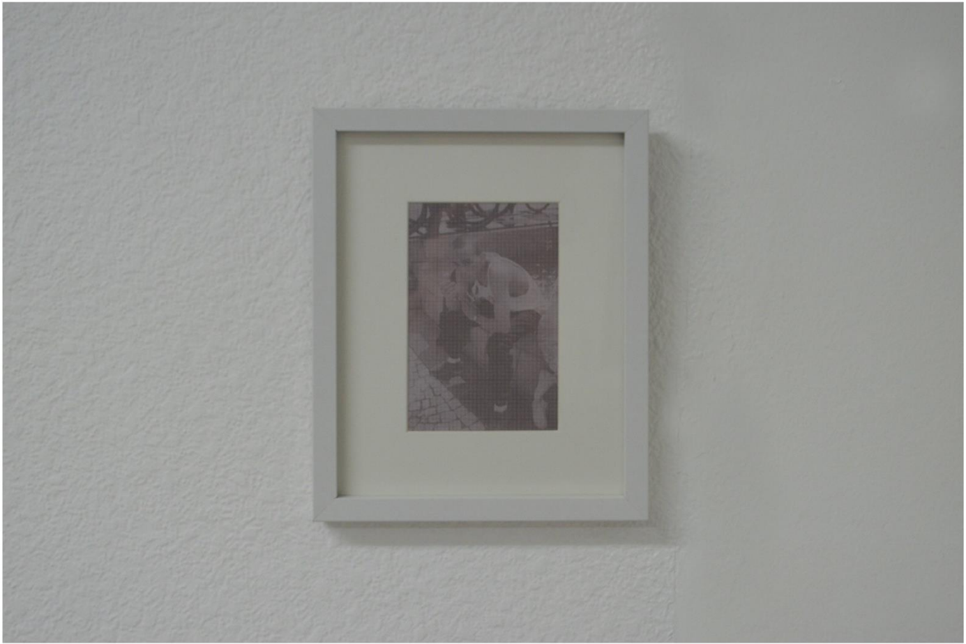
Connection Things , 2021, dimensions variable

Digital collage, archival print, framed.