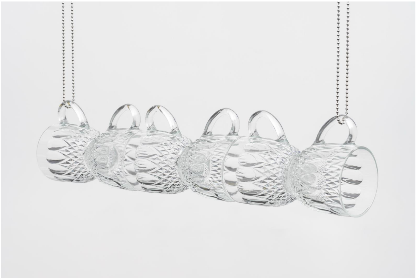
Pendulum: Still, 2024, 300x50x10cm, dimensions variable.

Cut glass, epoxy, Caribbean-sun-charged clear quartz, stainless steel chain.