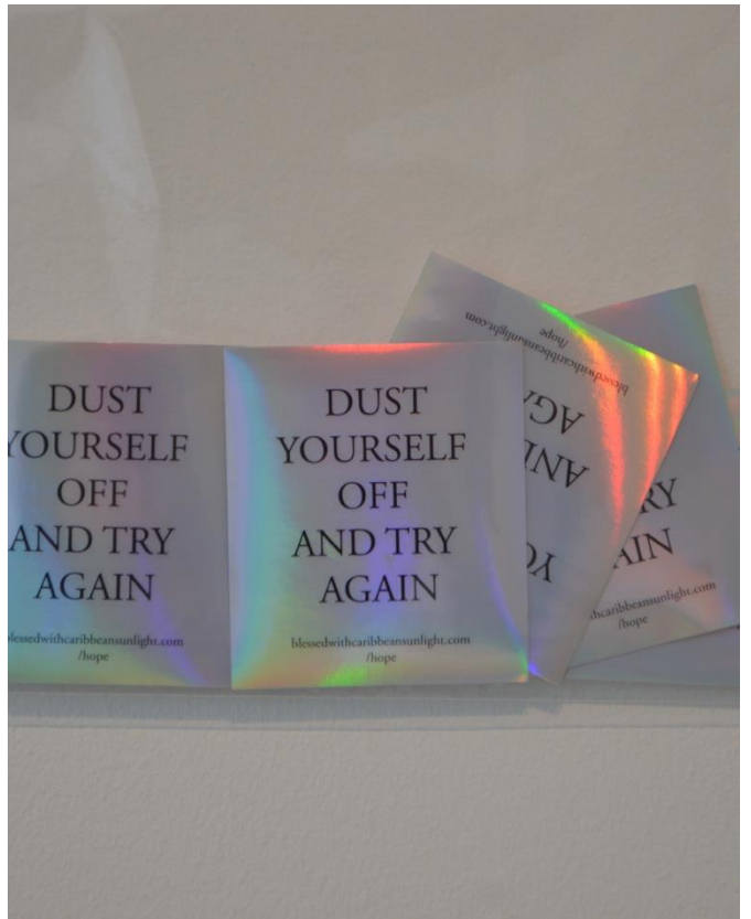
blessedwithcaribbeansunlight.com/hope , 2023, dimensions variable