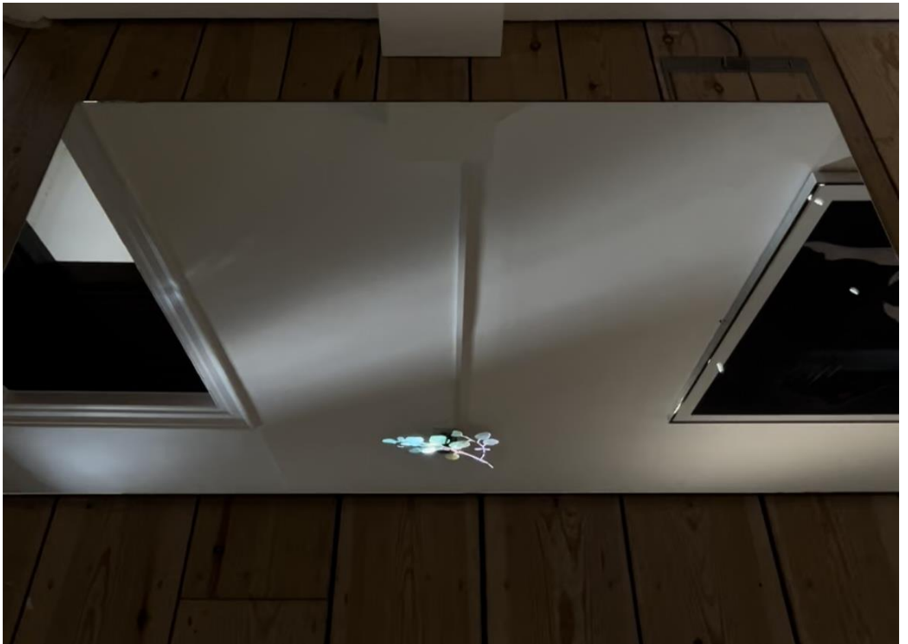
Close up images: blessedwithcaribbeansunlight.com , 2022

LED holographic fan, mirror, selenite, quartz, hematite, moon water.