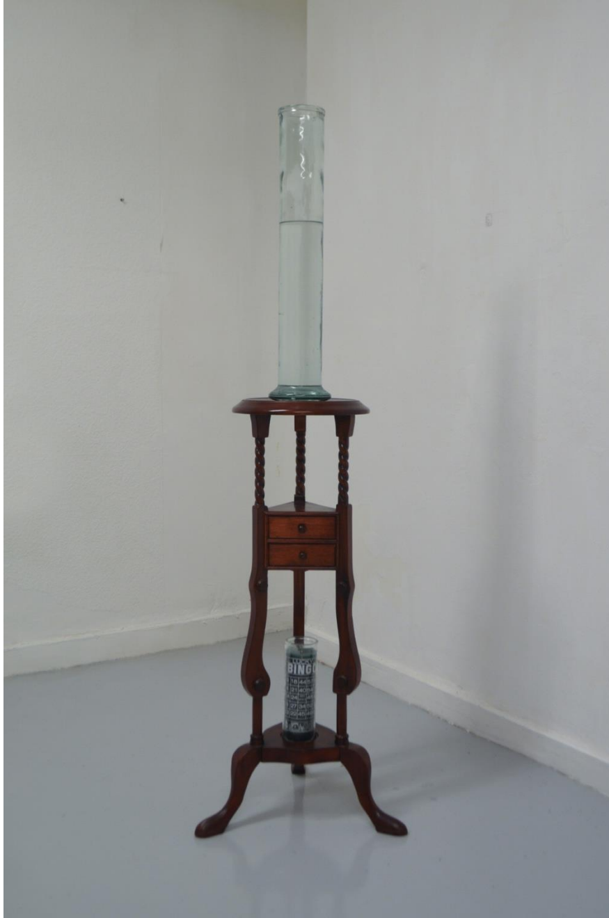
Altar with Moon Water, Afrique, 2021, 1.5x1x0.5m

Caribbean moon water, second-hand glass vessel, refurbished second-hand plant stand, 7-day prayer candle.