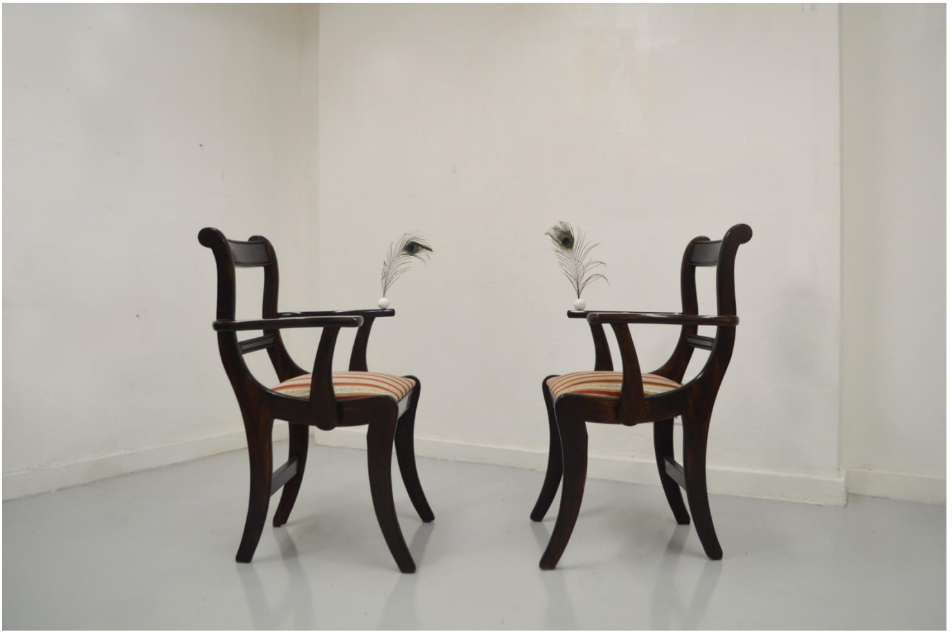
Old Souls/Two Lovers , 2021, 1x2x1m

Refurbished second-hand chairs, fallen peacock feathers, air-dried clay.